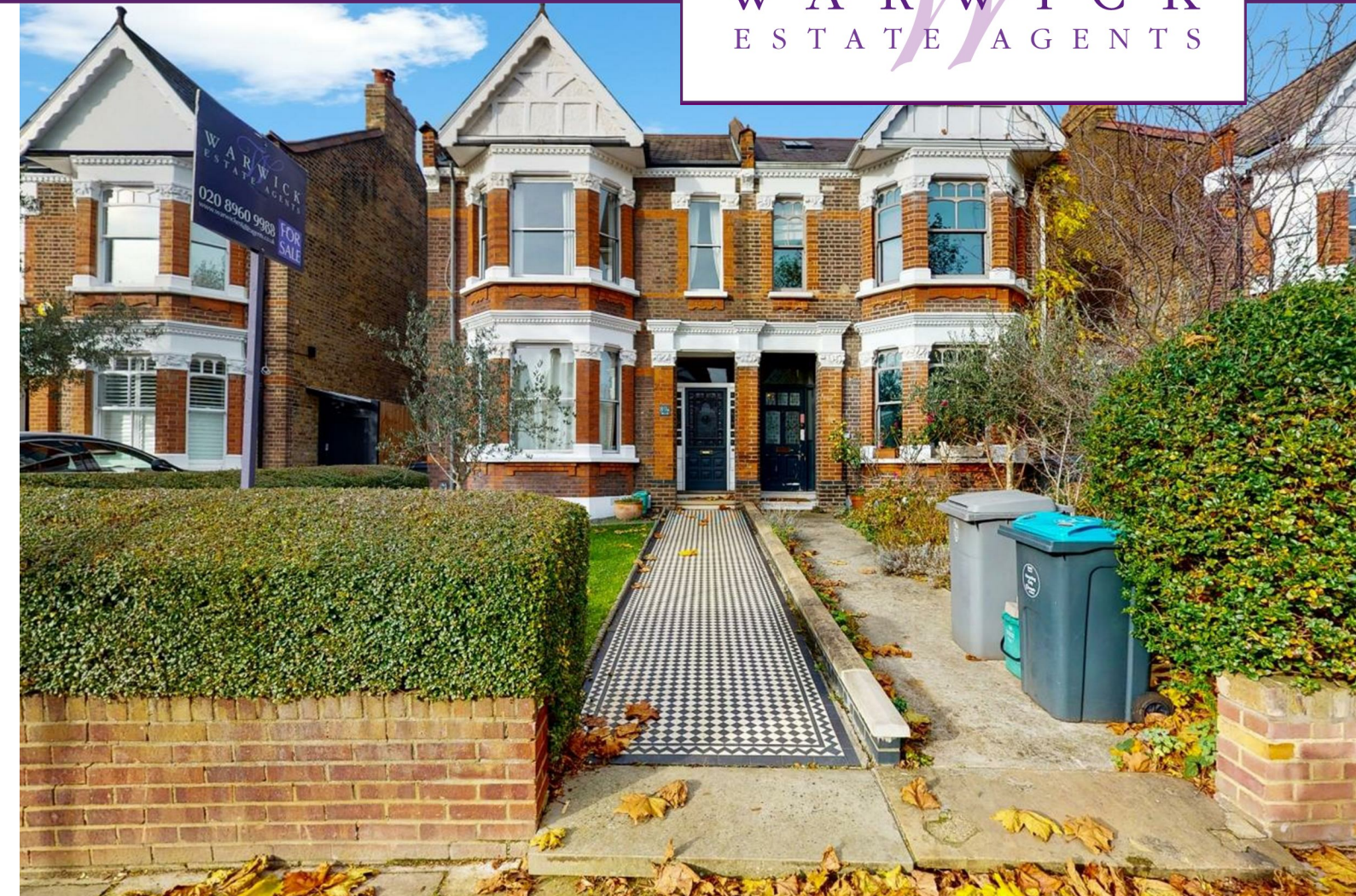
Chevening Road, Queens Park, NW6 6DA